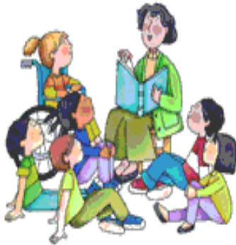
A Good teacher Explains...A Superior teacher Demonstrates...A GREAT teacher Inspires!